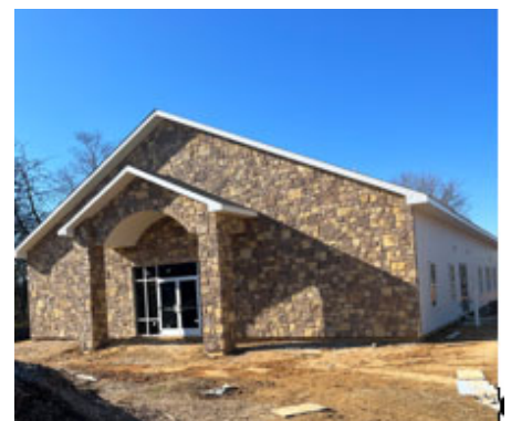
Prospective Church Building

It was a joy to return to Camp Blue Ridge after so many years. The weather was absolutely beautiful, and the entire experience was truly heartwarming. It was inspiring to see everyone supporting each other, stepping up as leaders, and working together to get things done.