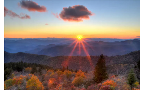
A view from the Blue Ridge Parkway.